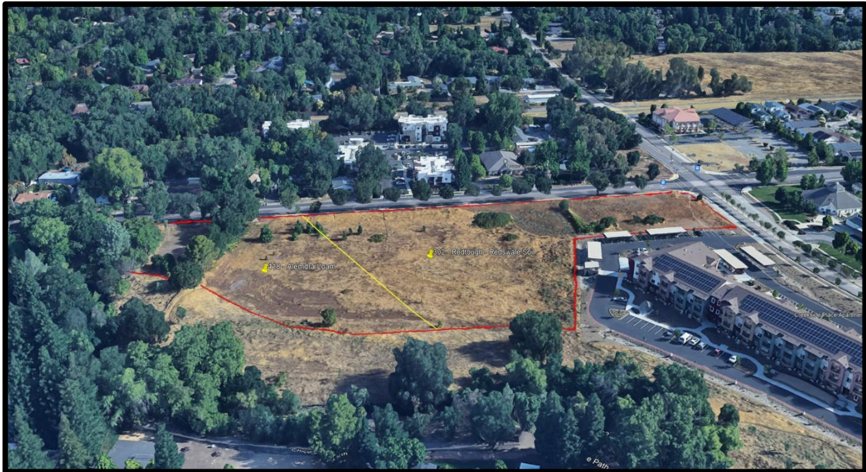
Figure 6A Google Earth and Satellite views of the Proposed Bike Park site on Humbolt Rd and Notre Dame Blvd in Chico, CA.

A recent site survey is available for viewing in the shared folder .