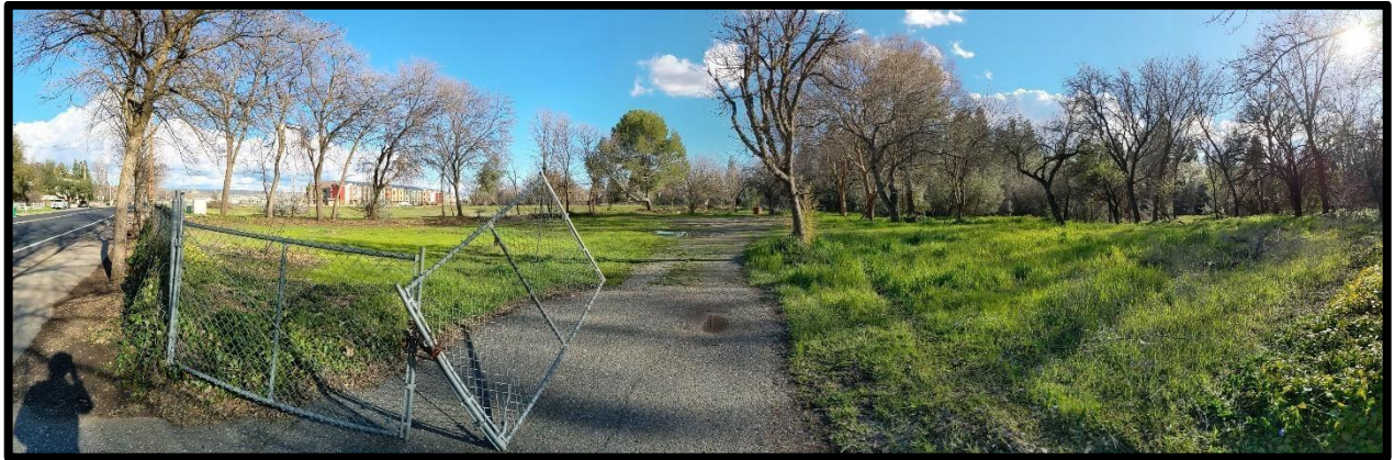
Figure 9 Photographs of the site. Northwestern end looking southeast.