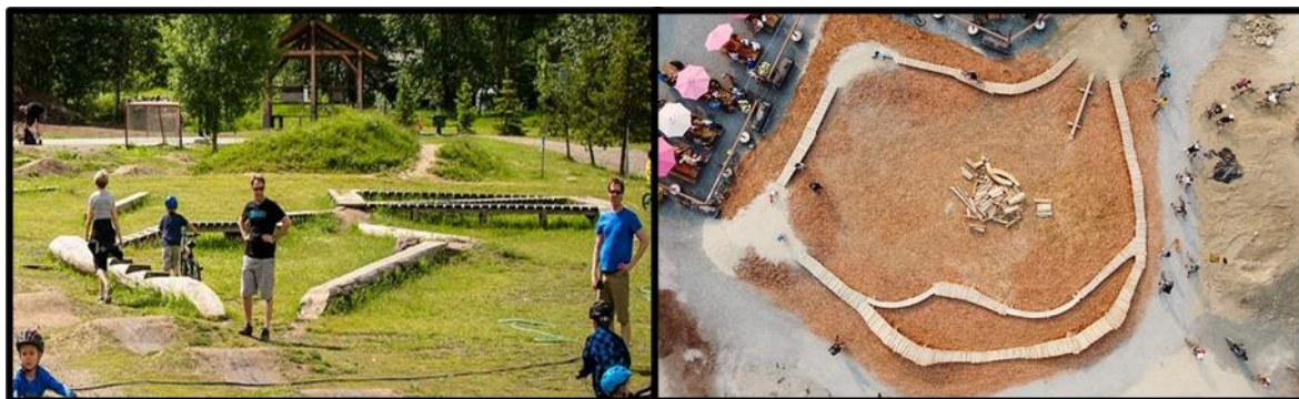
Figure 5 Example skinnies.