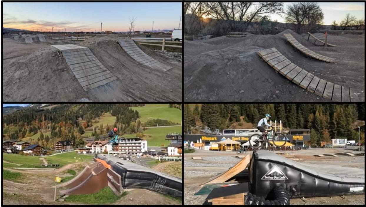
Figure 2 Example wood-dirt hybrid jumps and air bags of different sizes.