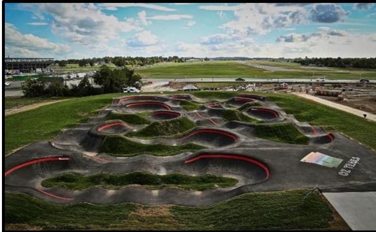
Figure 4 All-weather Asphalt pump track