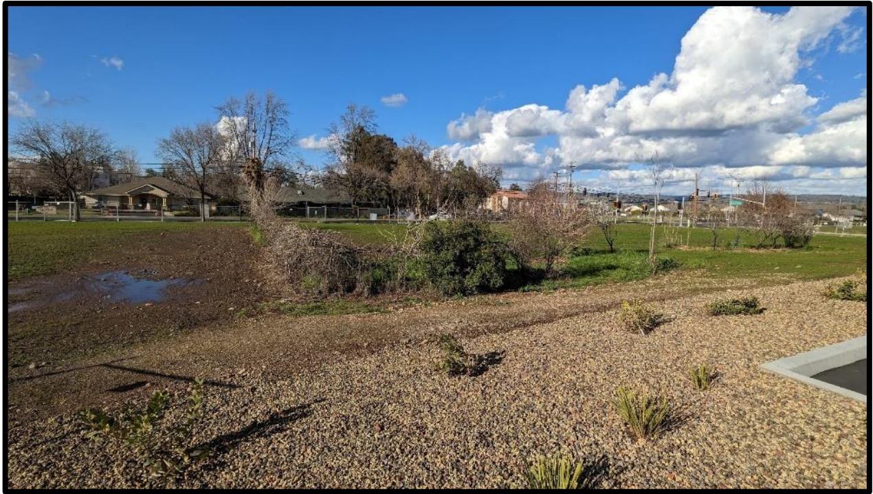
Figure 8 Photographs of the site. Eastern edge looking north.