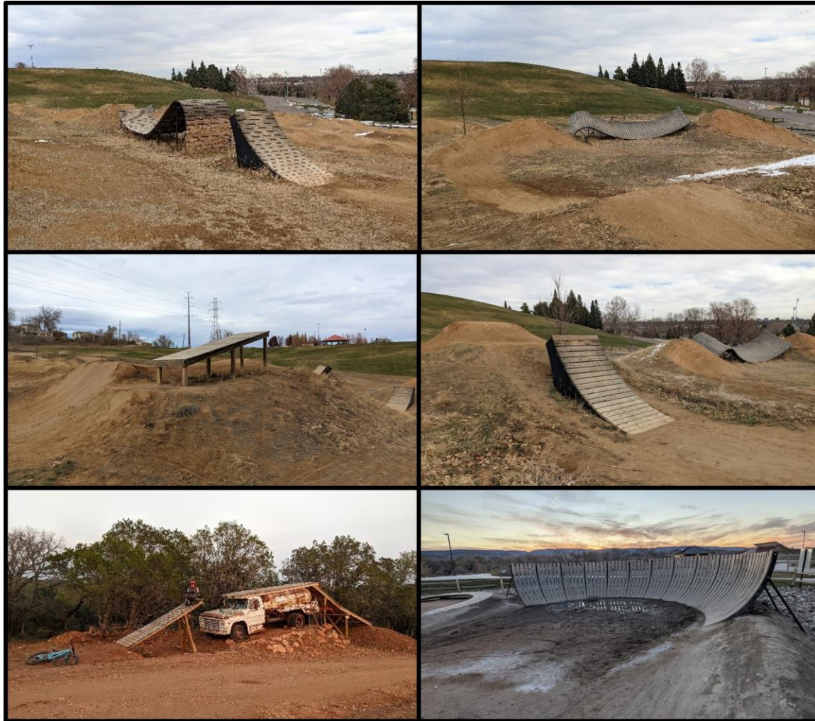
Figure 1 Example slopestyle features.