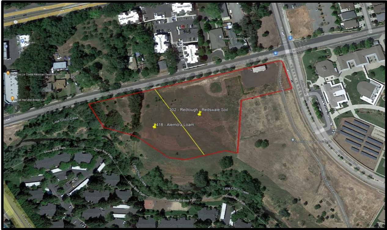
Figure 6B Google Earth and Satellite views of the Proposed Bike Park site on Humboldt Rd and Notre Dame Blvd in Chico, CA.