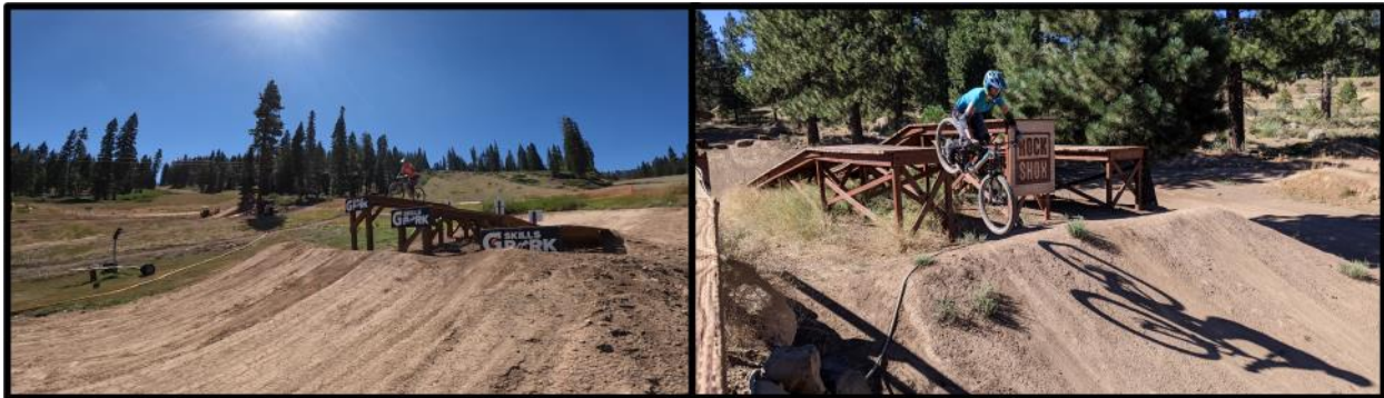
Figure 3 Example Drop Zones.