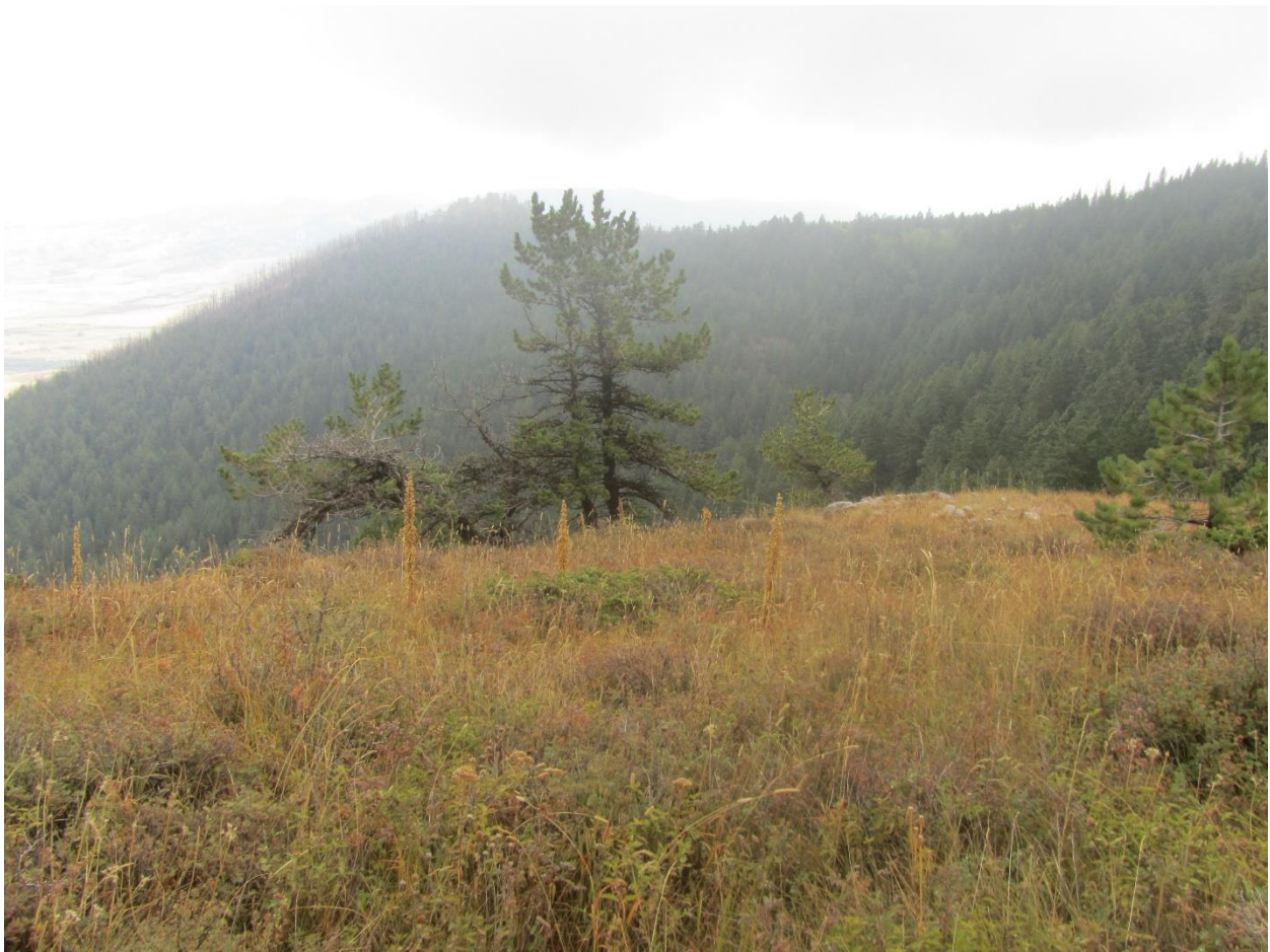
View from an adjacent ridge across to the forested area where the trail will be constructed. The trail will be entirely in forested country and does not traverse the meadow that is the foreground.