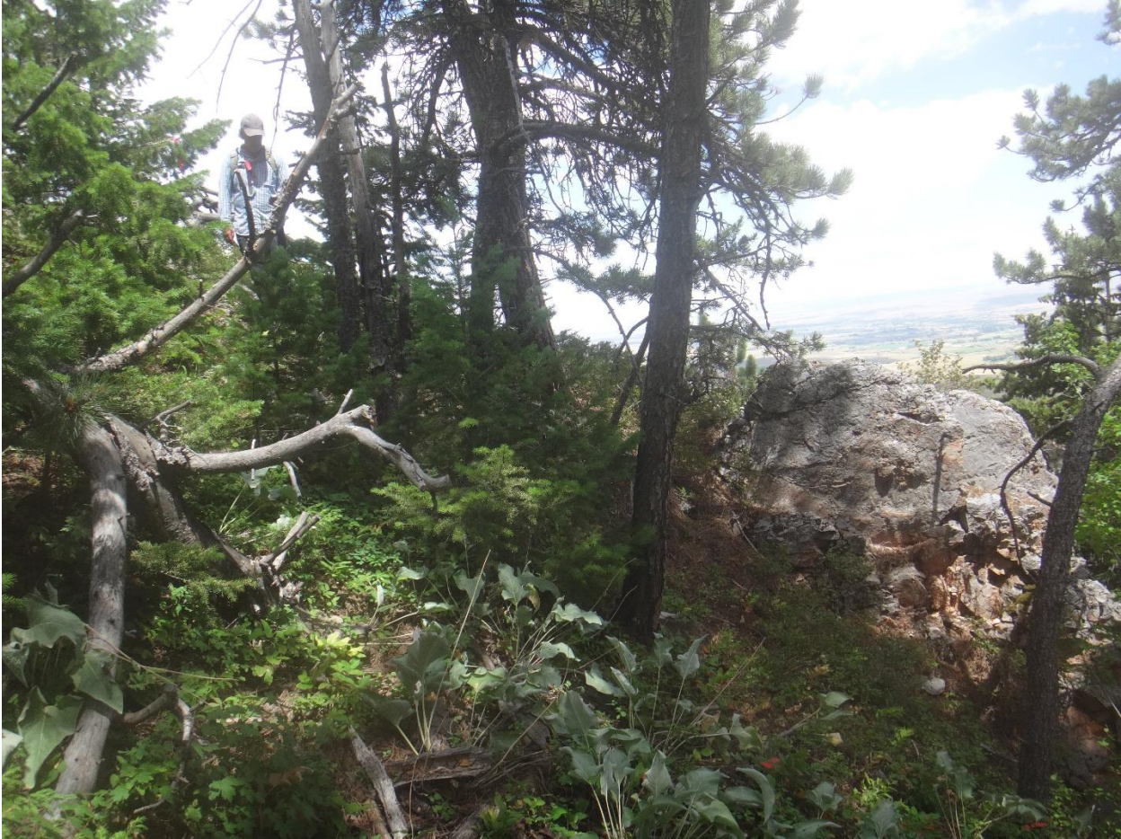
Rock outcroppings are mixed through the route.